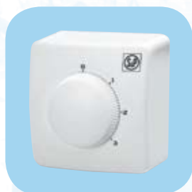
Three-speed control included. Dimensions LxWxH (mm): 68x42x113